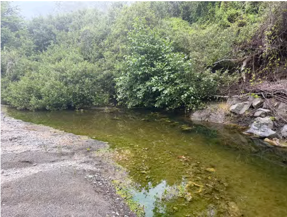
Occasional deep pools with vegetation provide habitat for frogs and fish.