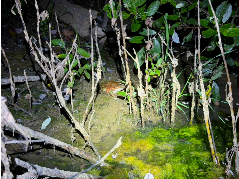
A CRLF on the creek bank.