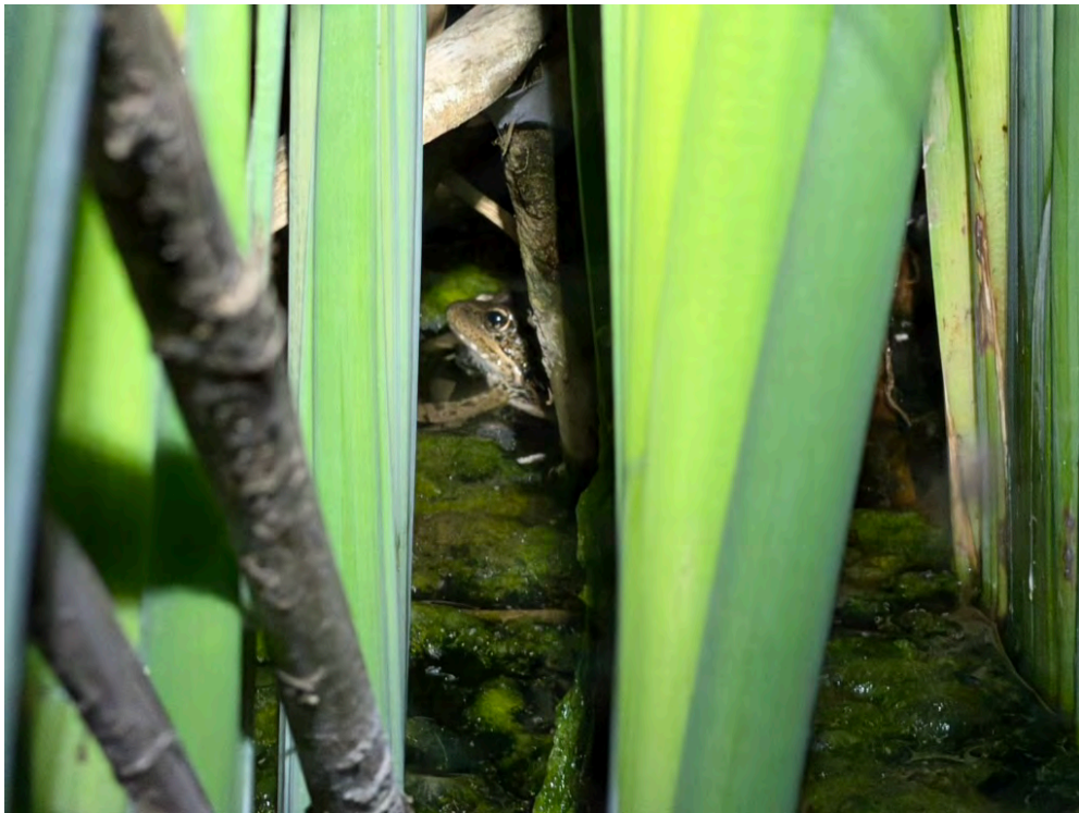
A CRLF deep in the bulrush.