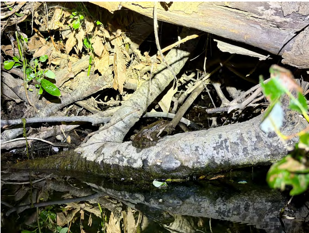
A CRLF out of the water on a branch.