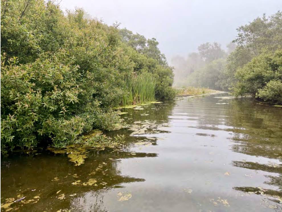
Creek banks are lined with willow and bulrush clusters.