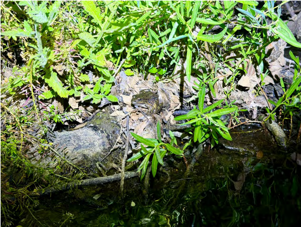
A CRLF out of the water on leaf litter.