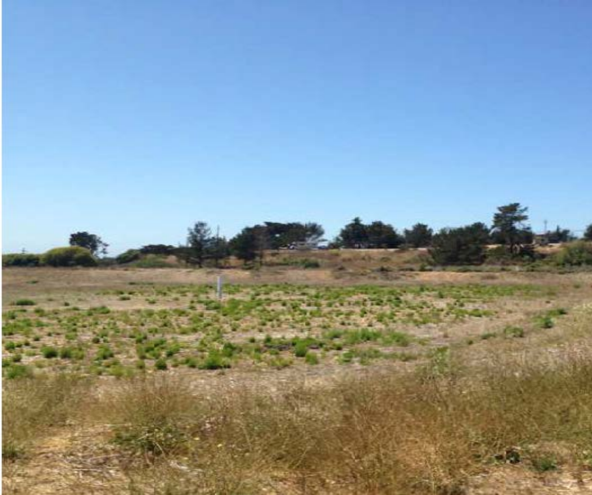
Photo 6. Reservoir in 2014 before repurposing.