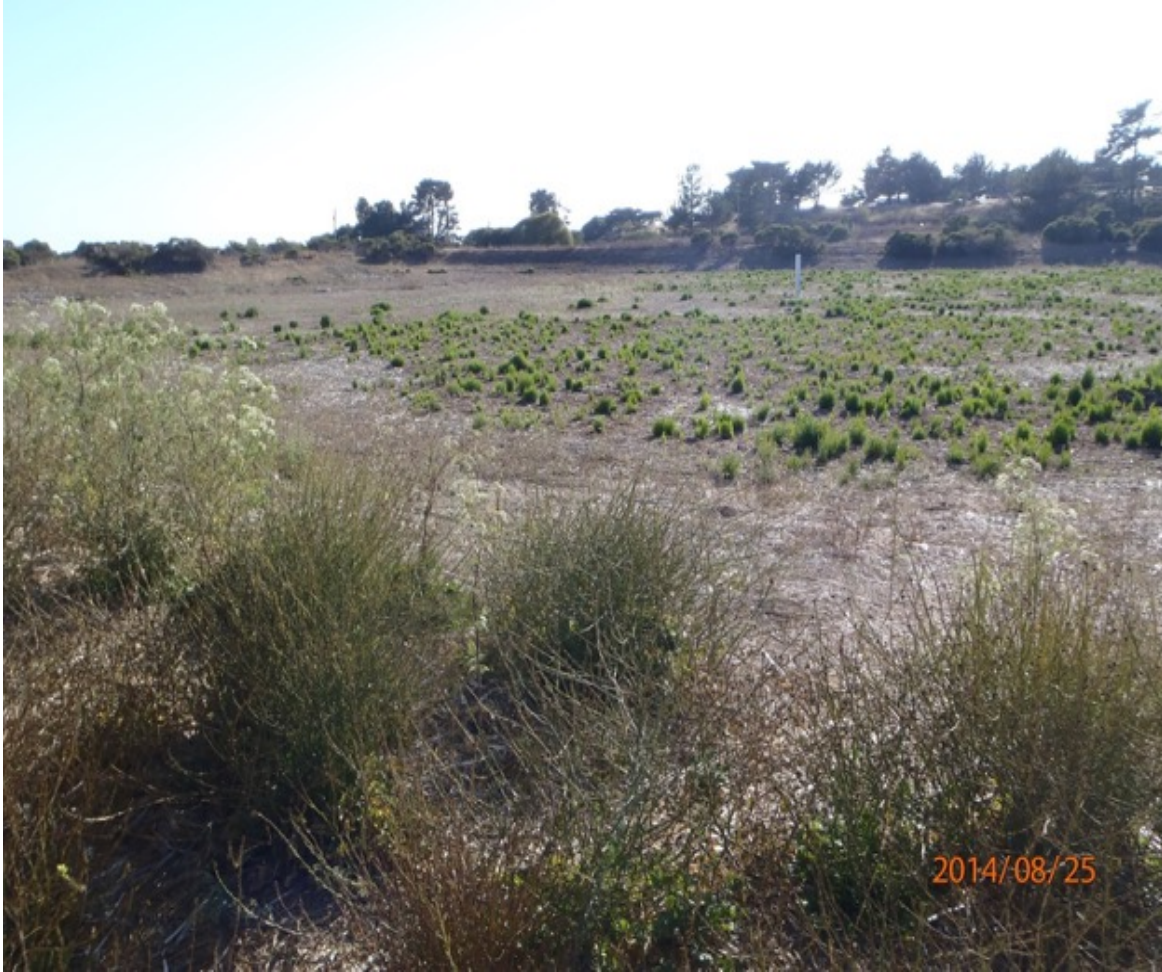
Photo 5. Reservoir in 2014 before repurposing.