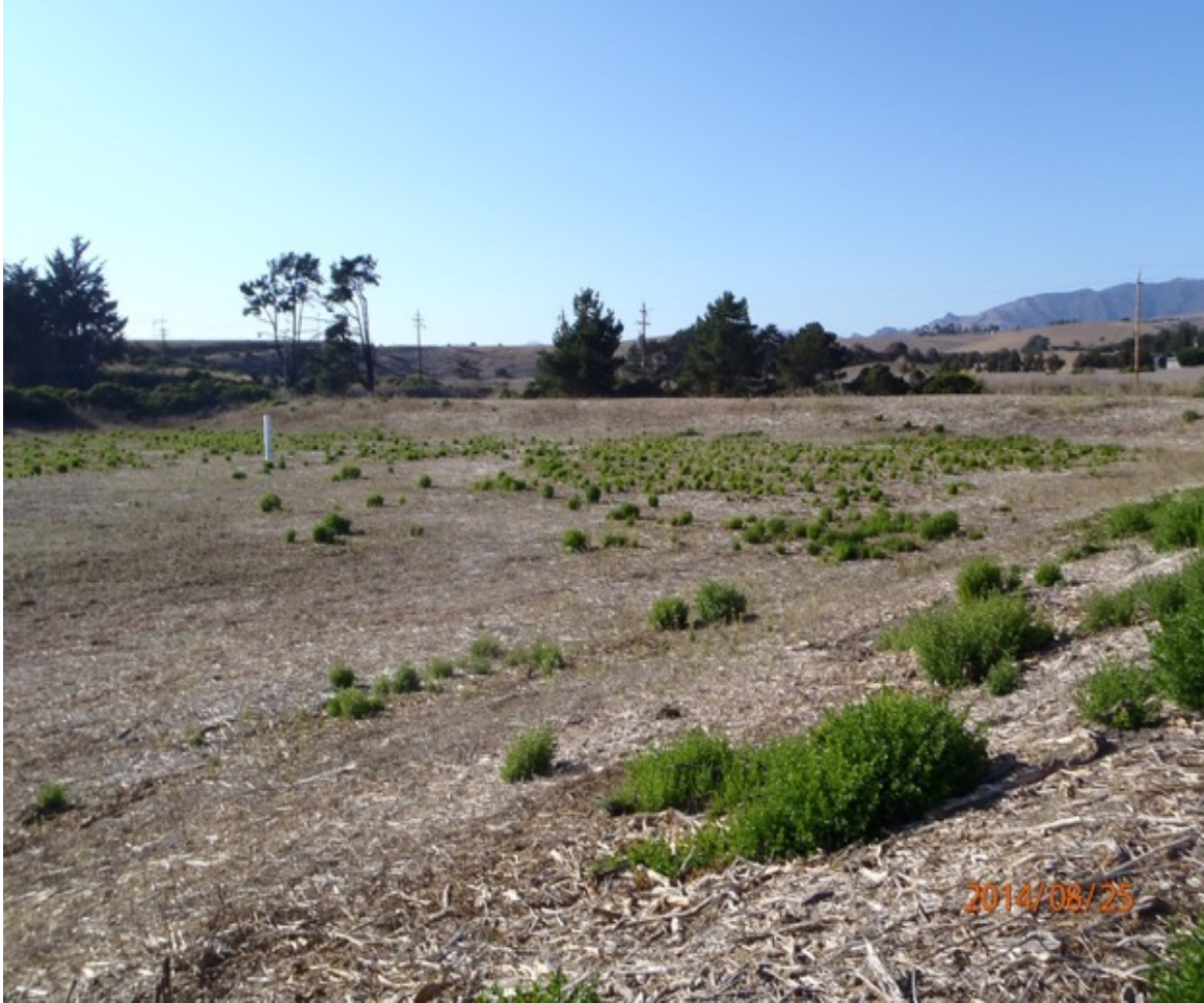
Photo 4. Reservoir in 2014 before repurposing.