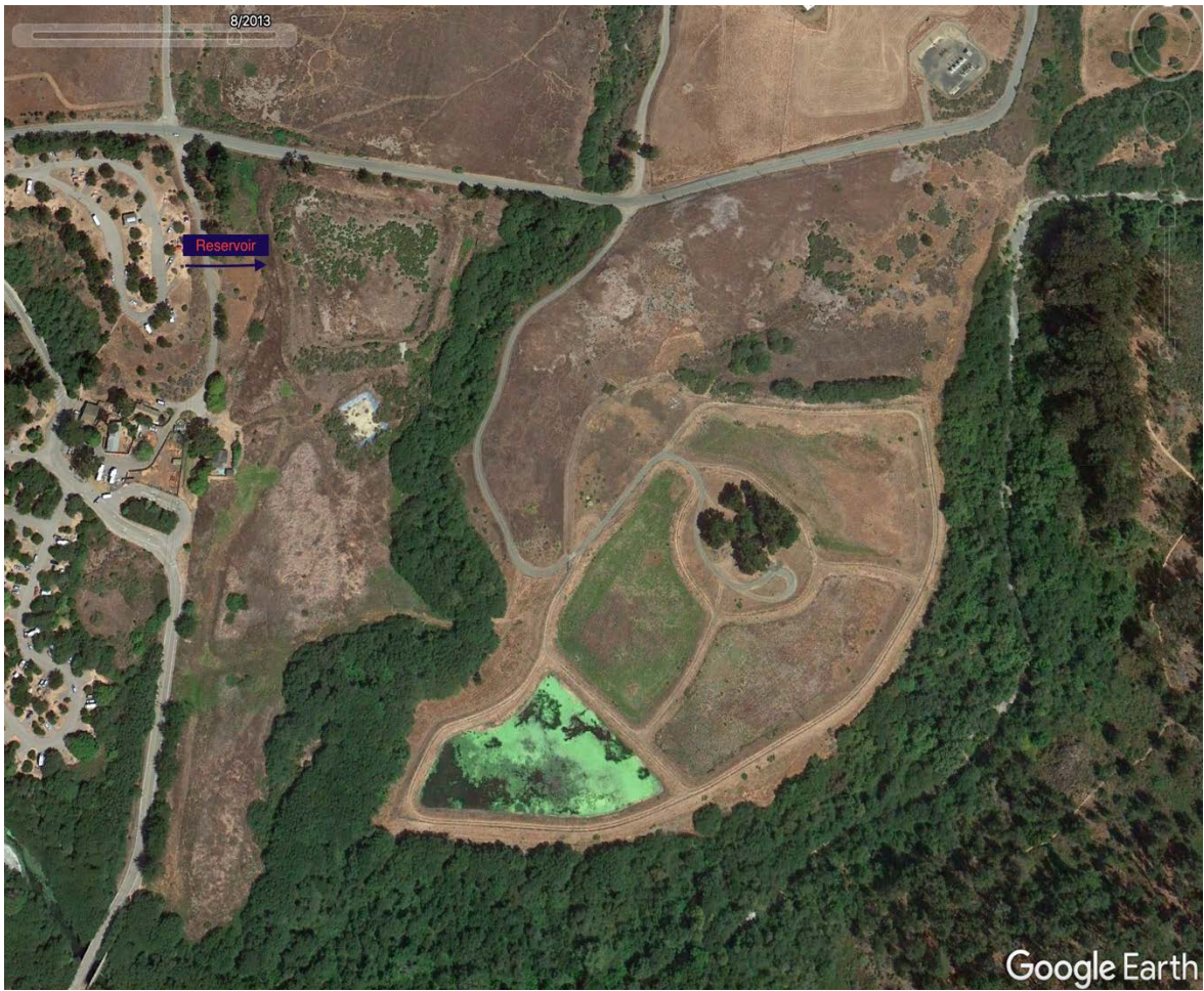
Photo 2. Google Earth photograph taken in 2013 of Reservoir before it was repurposed in 2014. Reservoir is located to the right of the arrow.