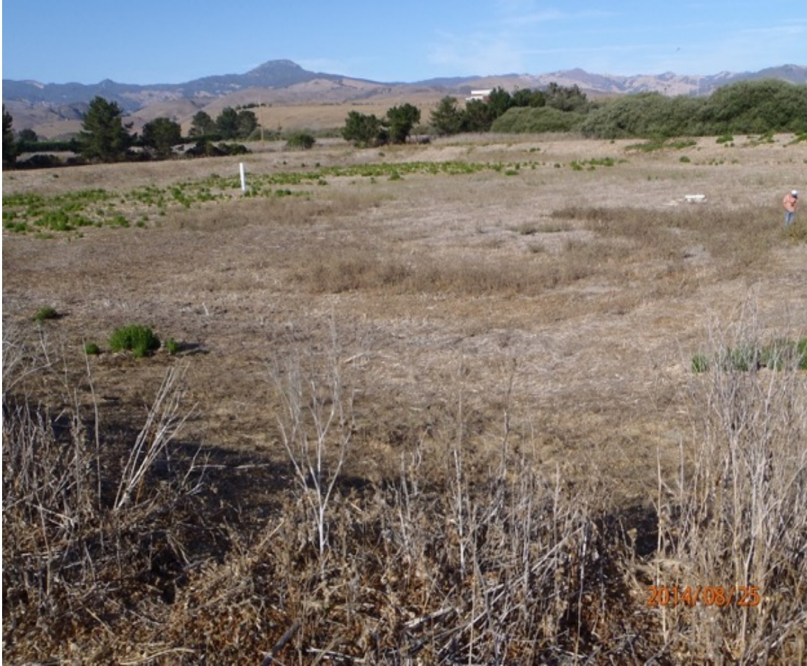
Photo 3. Reservoir in 2014 before repurposing.