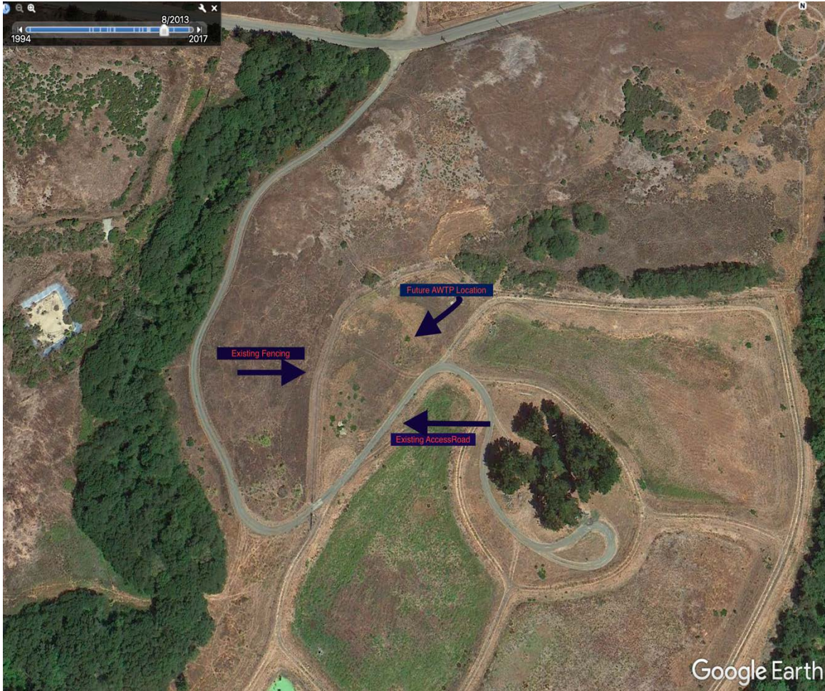
Photo 1. Google Earth photograph taken in 2013 of future AWTP location, existing fencing location, and existing access road location.