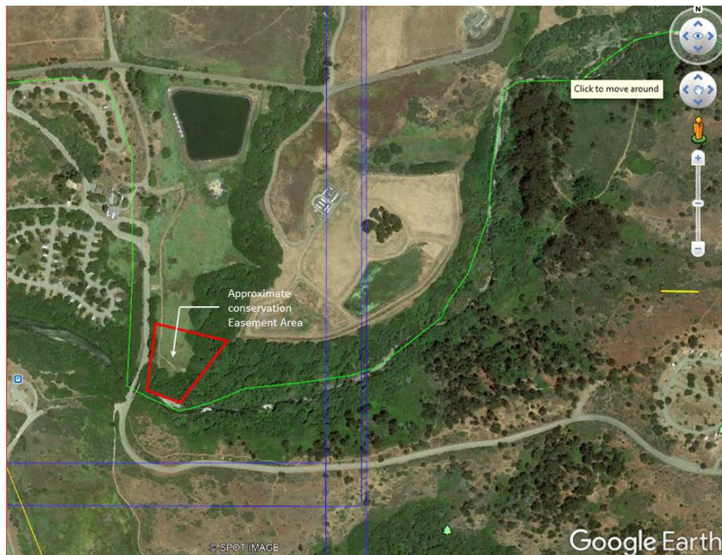
Approximate location of proposed conservation easement area.

During the September 24, 2018 field meeting with County, Coastal Commission, and CCSD representatives, the concept of providing a conservation easement on CCSD owned property was broached as a potential mitigation for incidental project impacts to unmapped and mapped ESHA. This was proposed adjacent to the lower reach of San Simeon Creek, which would be higher quality habitat for listed species, such as the California Red Legged Frog. This conservation easement would be conditioned to allow for well monitoring operations by CCSD staff, as well as installation of the revised lagoon water discharge structure. The lagoon water discharge is described within the certified SEIR as a future project modification. The following shows the approximate location of the proposed conservation easement.